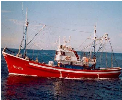
Figura 1. Fishing vessel ZERUKO ERREGIÑA