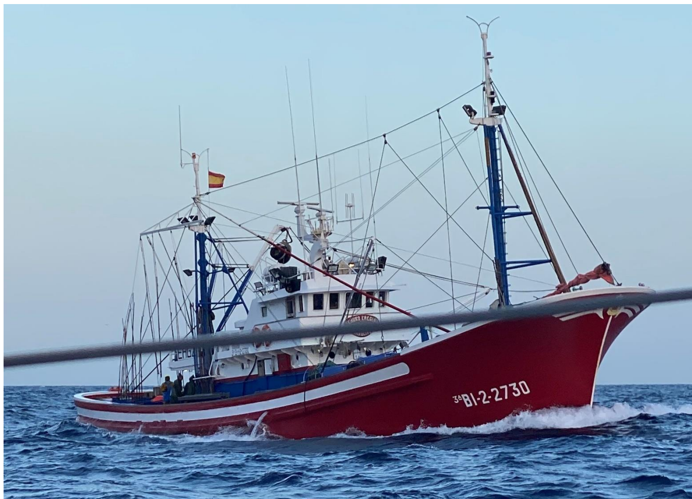
Figura 8. Photograph of the fishing vessel ZERUKO ERREGIÑA taken by the skipper of the CLEM just before the accident