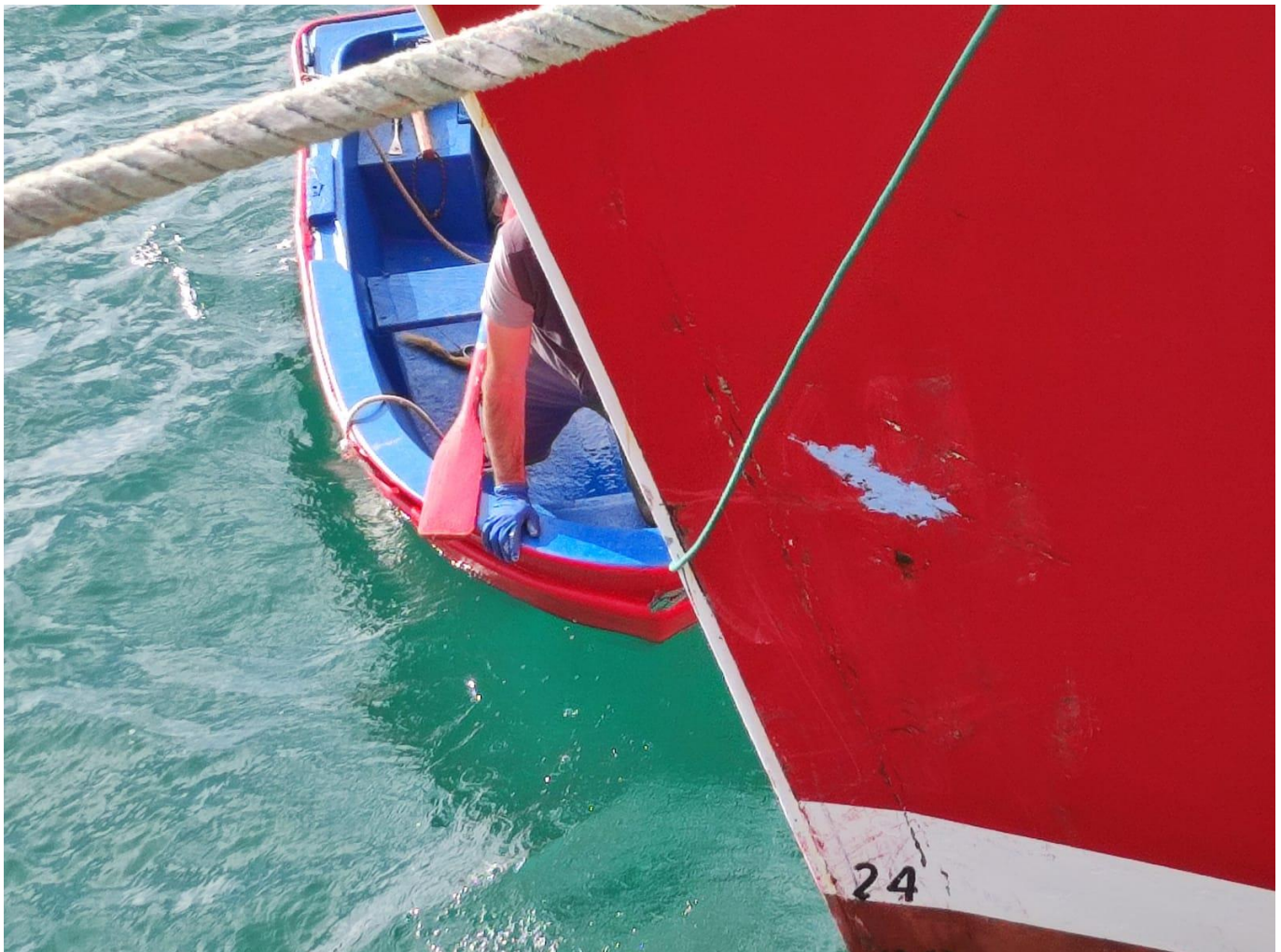
Figura 6. Close-up of the damage suffered by the ZERUKO ERREGIÑA during the accident

10 On 31 March a technician from a boatyard in Arrecife inspected the damage to the fishing vessel ZERUKO ERREGIÑA (see Figura 6). In his report, the technician stated that during his inspection he did not observe any structural 12 damage in the zone affected by the collision, but only a few scratches.