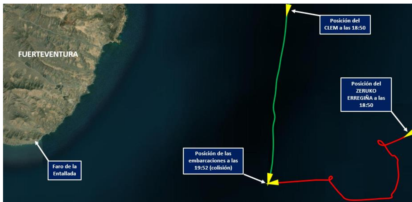
Figura 5. Courses followed by the fishing vessel ZERUKO ERREGIÑA (in red) and the recreational vessel CLEM (in green) since one hour before the accident. (Special data infrastructure viewer of the Hydrographic Institution of the Spanish Navy)