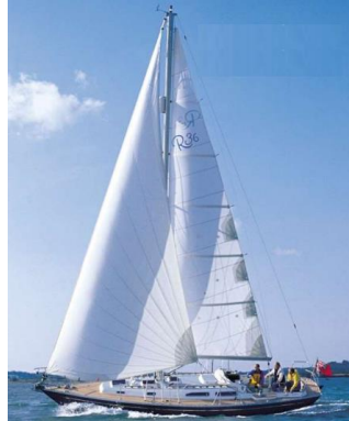
Figura 2. Rustler 36, model of the recreational sailing vessel CLEM