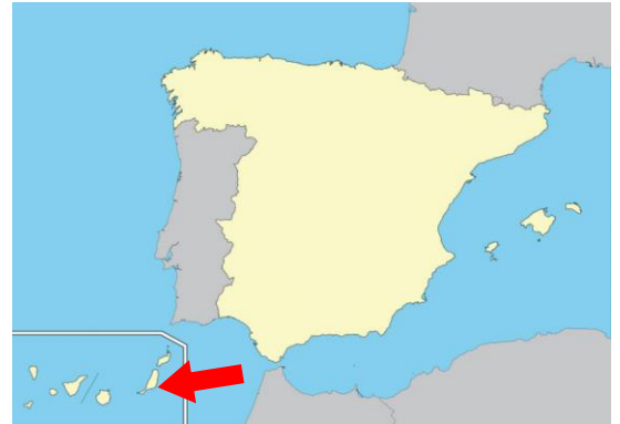
Figura 3. Accident site