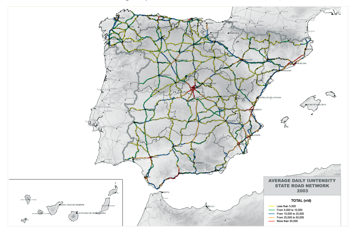
FIGURE 20. Average daily intensities on the State Roads Network (2003)

• The National Plan for Deployment of Intelligent Transport Systems (ITS).